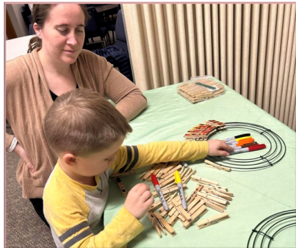
Decorating clothes pins for the Thankful wreath.