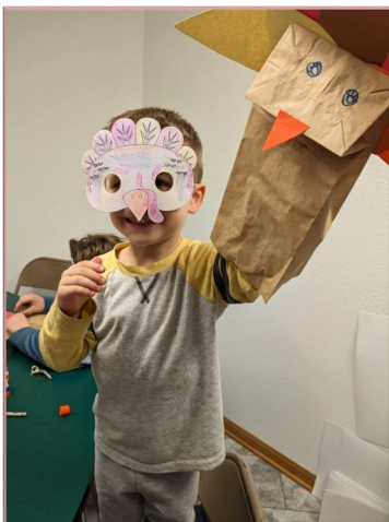
Cooper's fantastic turkey puppet.