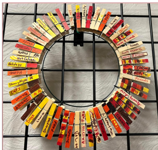
Thankful wreath - Everyone colored a clothes pin and wrote what they are thankful for to create this beautiful wreath that is displayed on the Get Connected Wall.