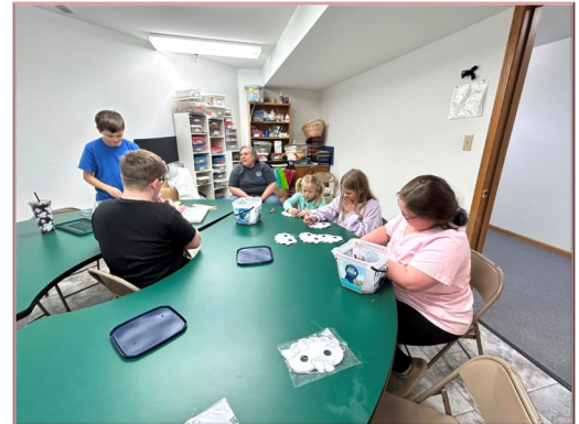
Friends decorating turkey masks .