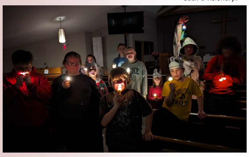
Friends used flashlights to look for missing wise men hidden in the sanctuary. After all the searching, they played a fun game called Fireflies. It was a BLAST! Everyone had a great time!

LENTEN BLaST BAGS can be picked up Sunday, February 11<sup>th</sup>